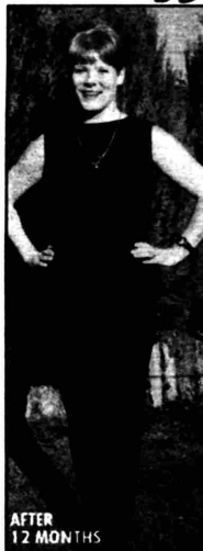
AFTER 12 MONTHS

December 29th I got on the scales at home and I was 19 stone. I decided to go on a diet but I could not stick to it as I was hungry all the time and I had no energy at all.