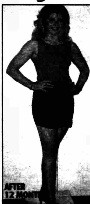
AFTER 12 MONTHS

Just over a year ago I was a stone overweight. Over the years I had joined 7 gyms plus a slimming club but could never get the weight off. I also tried virtually every slimming diet available, I just couldn't get results.