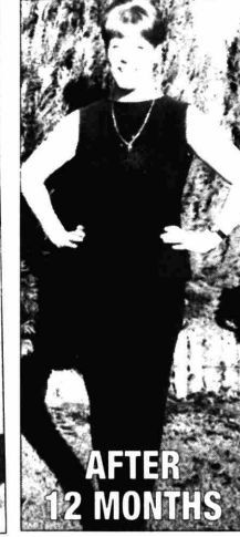
AFTER 12 MONTHS