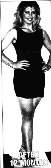
AFTER 12 MONTHS

MAIL ORDER FREEPHONE TELEPHONE: 1800 200 101