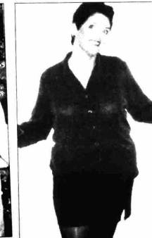
AFTER 3 MONTHS