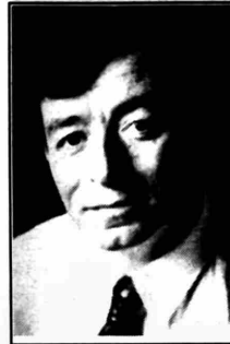
■ Minister Noel Dempsey and Government chief whip Seamus Brennan are among the driving forces of Oireachtas reform.