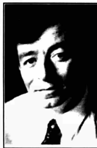
■ Minister Noel Dempsey and Government chief whip Seamus Brennan are among the driving forces of Oireachtas reform.