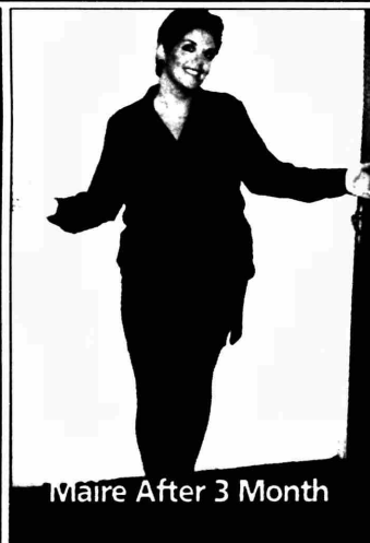
Maire After 3 Month