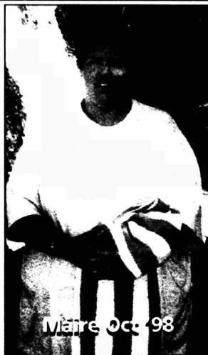
Maire Oct '98