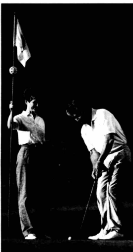
HEALTHCARE: 'The doctor of the future will give no medicine but will interest their patients in the care of the human frame, in diet and in the cause and prevention of disease' - Thomas A. Edison.