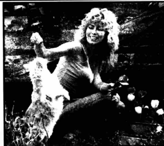
HEALTHCARE: 'The doctor of the future will give no medicine but will interest their patients in the care of the human frame, in diet and in the cause and prevention of disease' - Thomas A. Edison.

Nutritional Science has made revolutionary progress in recent years and now we are seeing high-tech, specially designed products to meet specific needs. Now for the first time we are