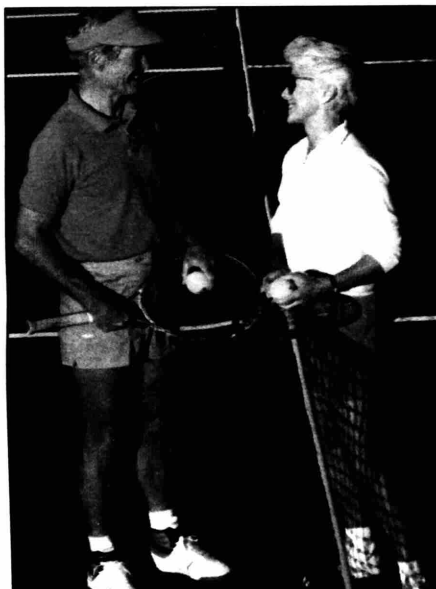
HEALTHCARE: 'The doctor of the future will give no medicine but will interest their patients in the care of the human frame, in diet and in the cause and prevention of disease' - Thomas A. Edison.