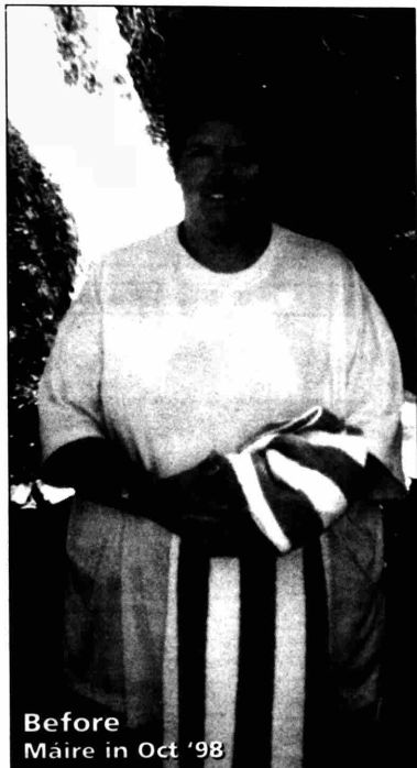
Before Maire in Oct '98