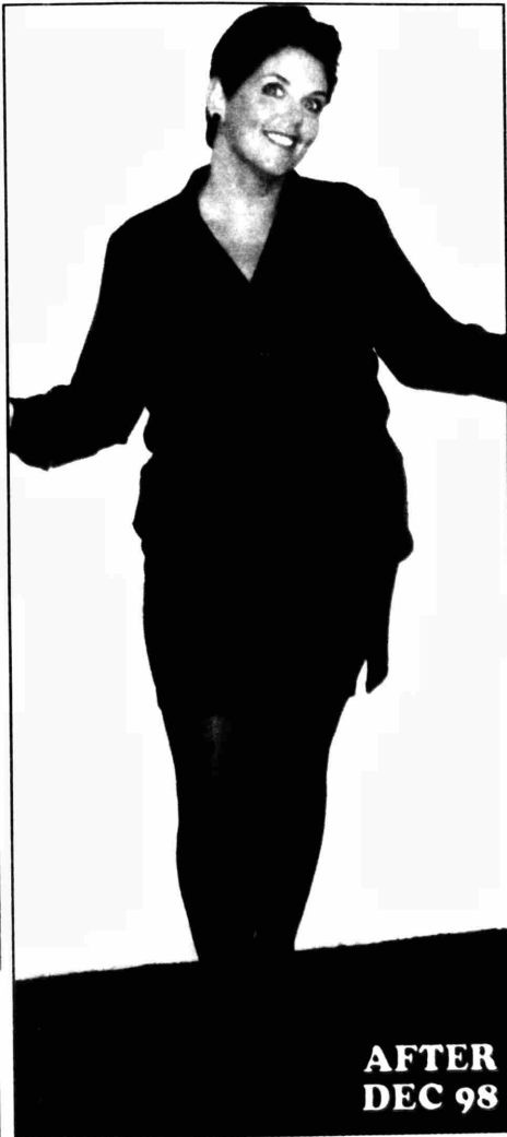
AFTER DEC 98