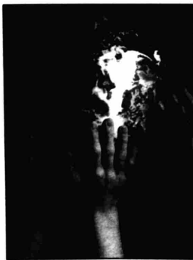
■ The future of the world is in our children's hands

BREEF is all about education. It was founded in 1993, and at the moment is mainly concerned with the islands of the Bahamas - all 700 of them! We began by working with school teachers. Forty teachers a year are educated to think both locally and globally. We help them to run outdoor education classes, to awaken a sense of wonder in and