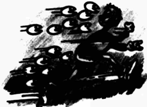
• Free radicals attack healthy cells making us more vulnerable to illness and aging

A growing number of scientific research studies are showing that a powerful group of nutrients known as antioxidants appear to slow the aging process, while offering protection against many age related degenerative illnesses. These include heart disease, cancer, brain and immune system damage, arthritis even wrinkles.