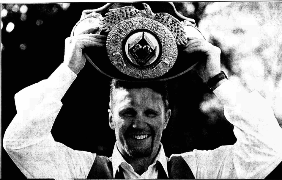
It's all mine... new WBO world super-middleweight boxing champion Stephen Collins shows off his title belt after his sensational defeat of Chris Eubank at the Green Glens arena in Millstreet on Saturday.

Collins even went as far as to listen to a Walkman playing one of the 'Rocky' themes to cut himself off in the ring preliminaries while Eubank made his lavish entry on a Harley Davidson motor cycle.