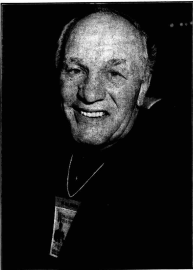
Our 'Entry... former heavyweight boxer Henry Cooper was in Millstreet to enjoy the fight